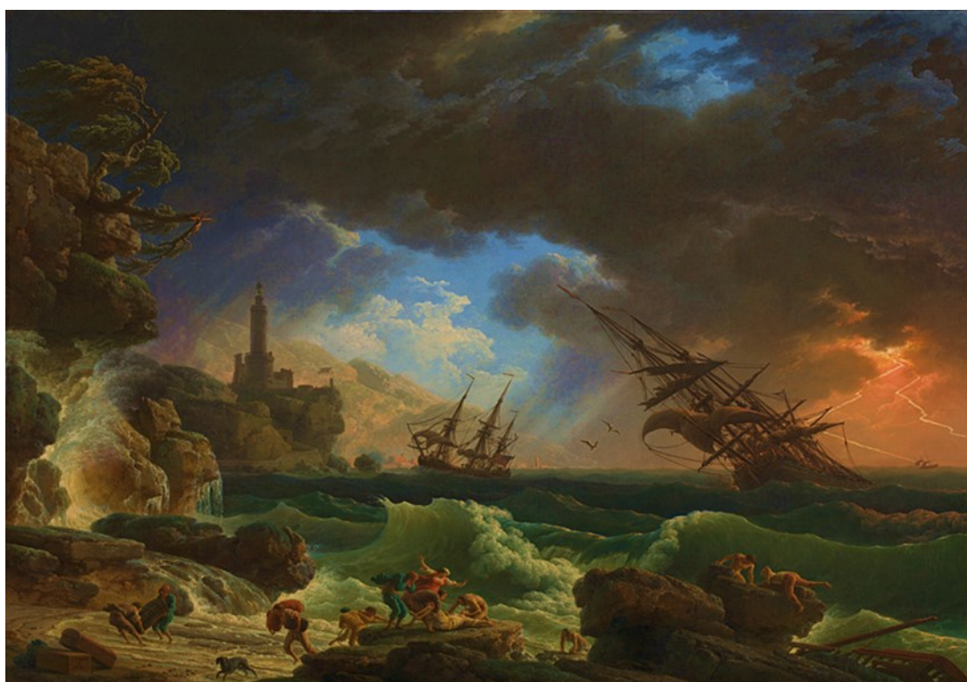
A Shipwreck in Stormy Seas' by Claude-Joseph Vernet