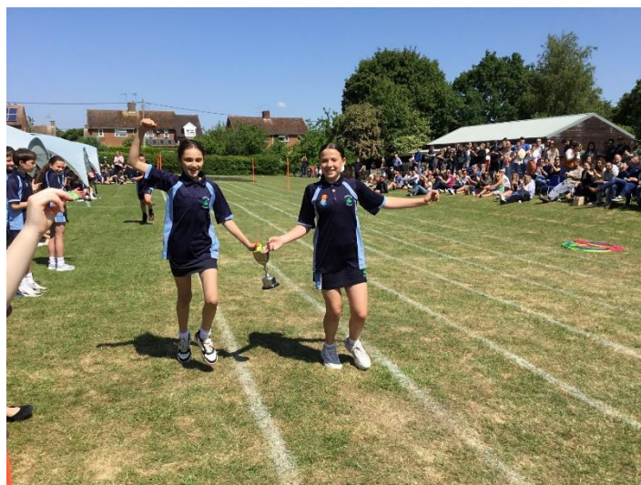
Oliver House Captain and Deputy Captain